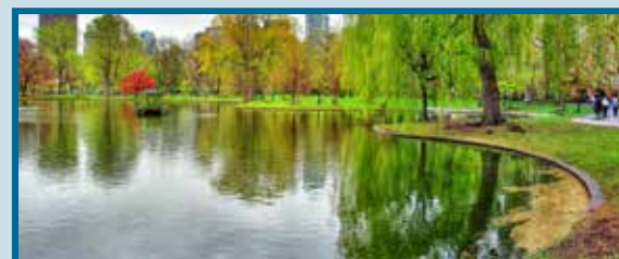
Boston Public Garden

4:00–5:15 pm EERI—LEARNING FROM EARTHQUAKES EERI's flagship Learning from Earthquakes program will be highlighted with a focus on lessons learned from recent earthquakes (including the 2014 Napa CA Earthquake), how