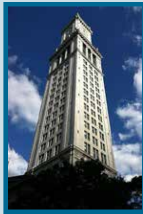
◀ Custom House Tower, Boston